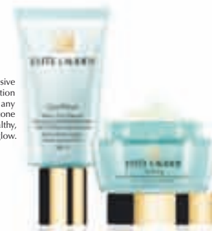
The exclusive Sheer Tint lotion enhances any skintone with a healthy, even-toned glow.

*In vitro testing, comparing the proprietary Super Anti-Oxidant Complex with widely used anti-oxidants such as Alpha-lipoic acid, Kinetin, Vitamin C, Vitamin E, Coenzyme Q10 and Idebenone.